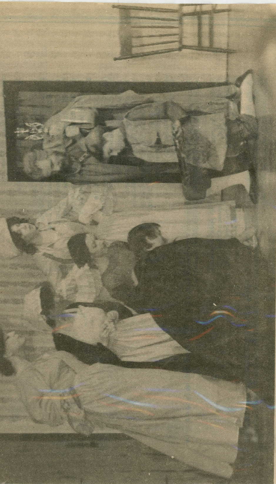
THE SHOE WAS ON THE PROPER FOOT on the weekend as the Stage North and Workshop players presented Cinderella several times at Northern Lights College. The play played to packed houses for each performance.