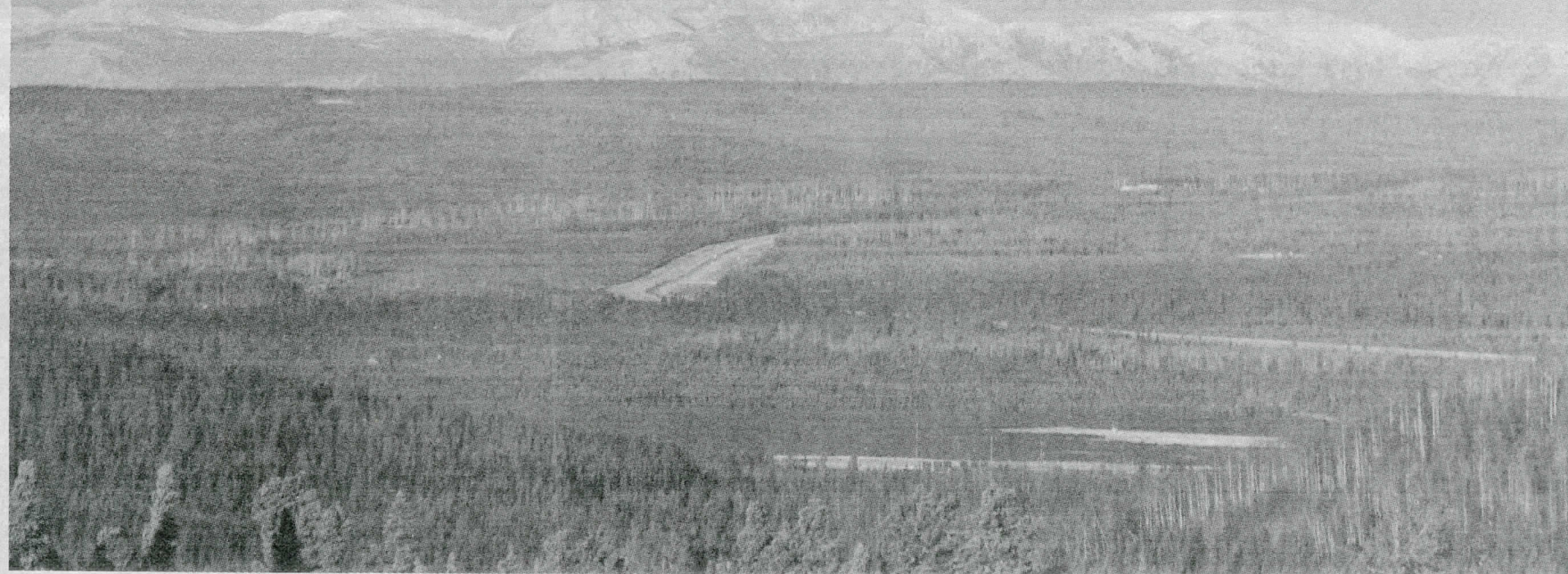
The Alaska Highway slices its way through the Northern Rockies north of Pink Mountain.