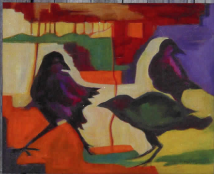
A RAVEN RAVE by MARY PARSLOW

THIS EXHIBIT WILL BE ON DISPLAY UNTIL JUNE 10, 2012