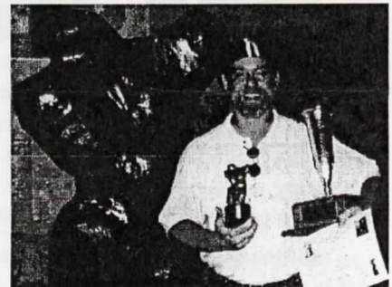
2003 - Best Actor Award