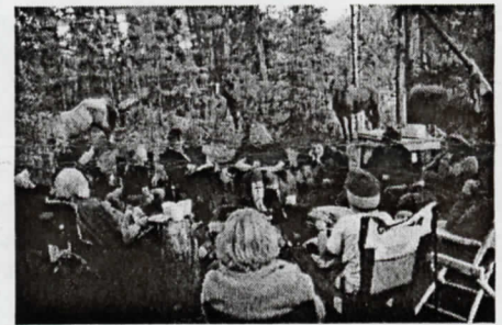
Through presentations and informal dialogue, artists had a chance to share ideas and approaches to art.