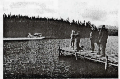
Artists from across Canada traveled to Mayfield Lake via float plane from Muncho Lake.