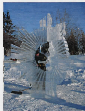
Ilya Filimontsev 1st Place Abstract