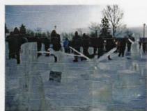
ArcTech Welding & Machining