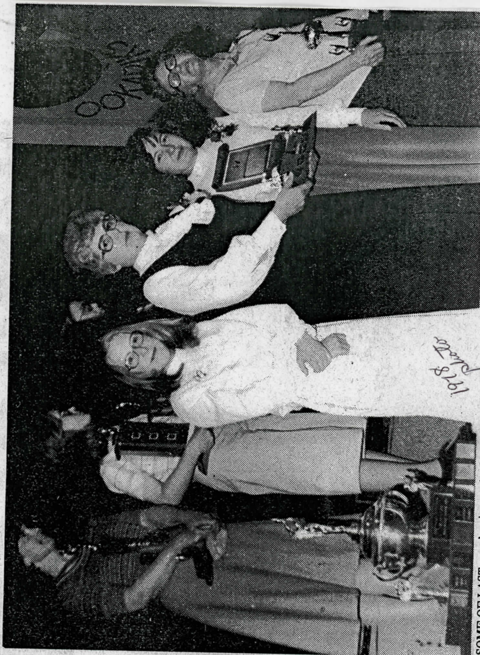
SOME OF LAST year's winners in the Arts Festival line up with their trophies at the end of the presentations. Last year there were some 29 groups and individuals awarded prizes

Music classes include several choirs and some delightful operetta ex-