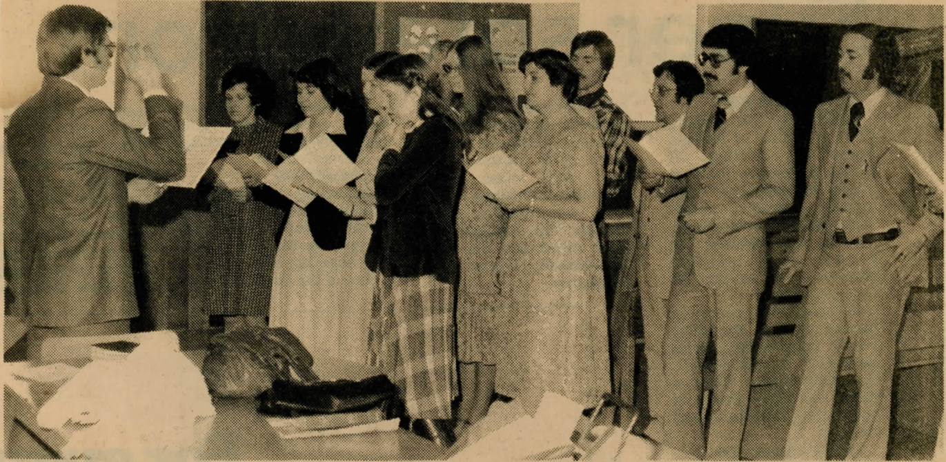
THE ALLIANCE CHURCH choir is shown here practicing up. Practice makes perfect, they proved Wednesday when

they won the choir section of the local arts festival. The only question now is: will they turn pro?