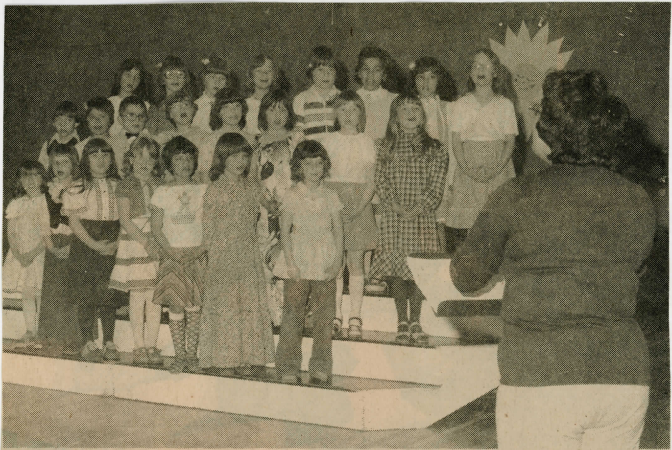
ANOTHER GOLD WINNING song at the Arts Festival was Eidelweiss, sung by the Grade 1 and 2's, who repeated the