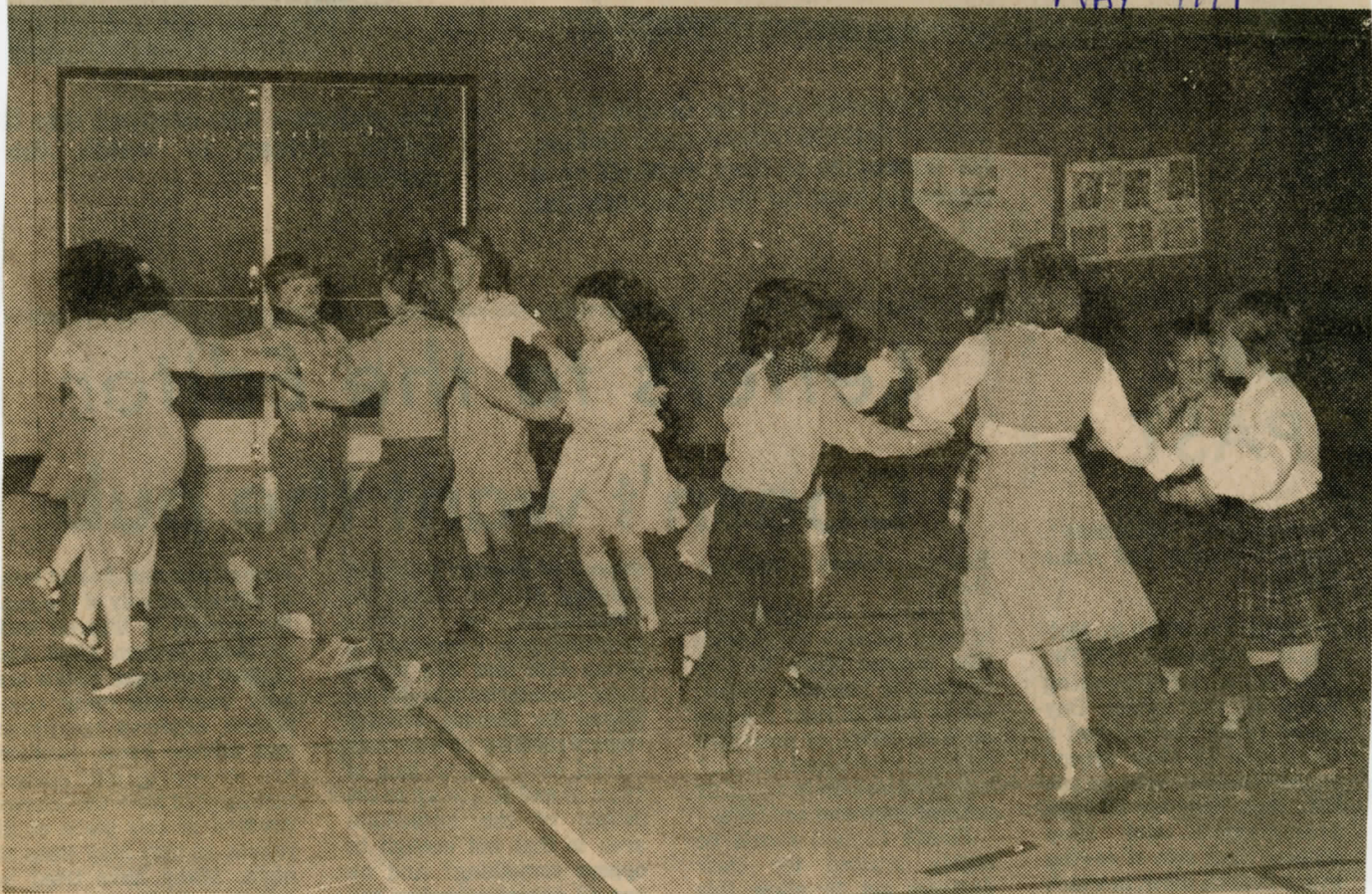
THE RED RIVER Square Dance was a gold winning performance at a recent arts festival, and these grade 2 and 3's