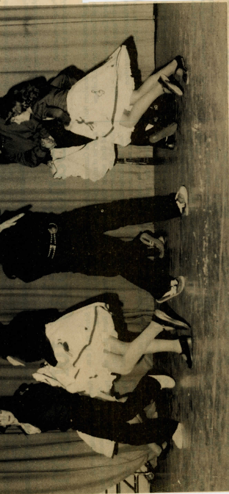
Square dance has been a popular entry into the North Peace Performing Arts Festival. Charlie Lake Elementary School has entered square dance this year. The above picture is from a 1980's Festival.