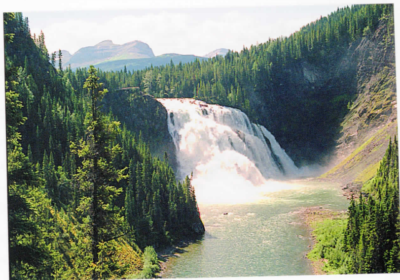
Kinuseo Falls