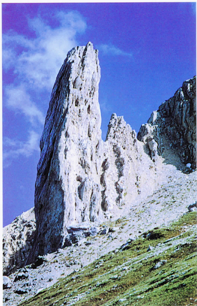
Photo: Albright Hoodoos