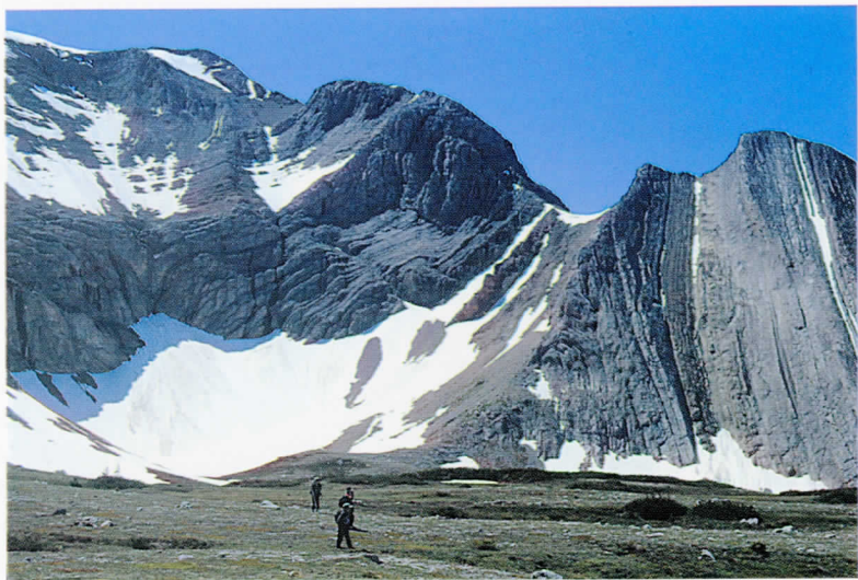
Hiking Mount Wapiti