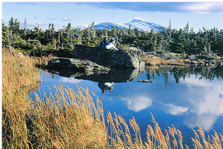
Photo: Babcock Tarns