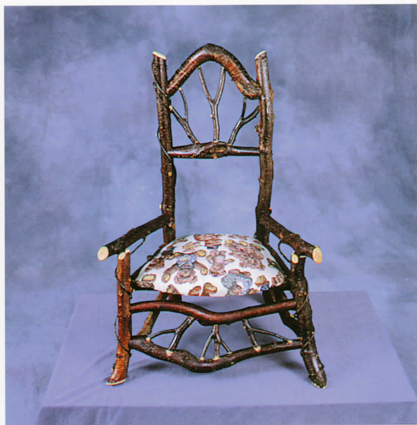
"Teddy Bear Chair" Woodland Whimsy