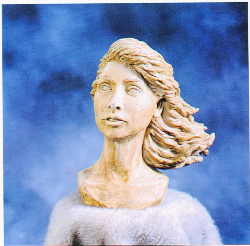
"Tea-Na" Ceramic Sculpture Dori Braun