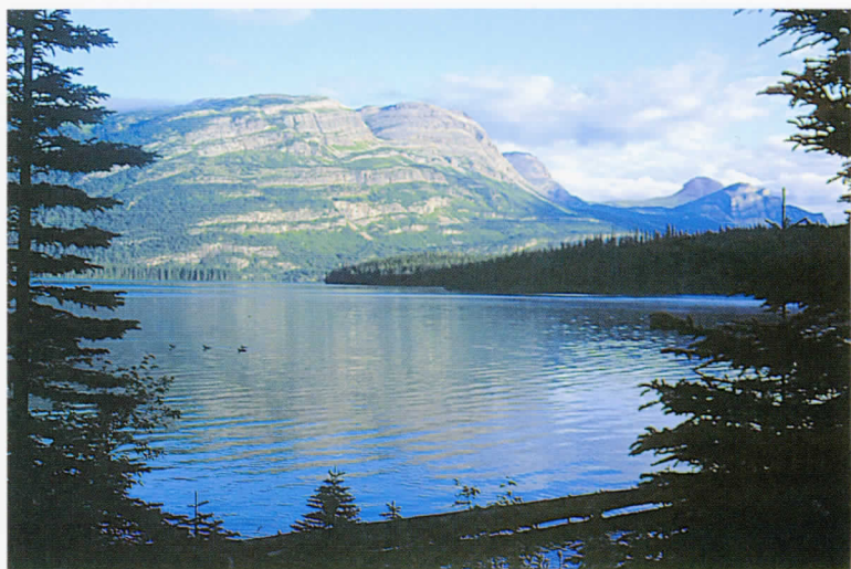
Photo: Monkman Lake