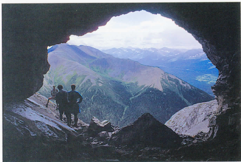
Photo: Tunnel Cave