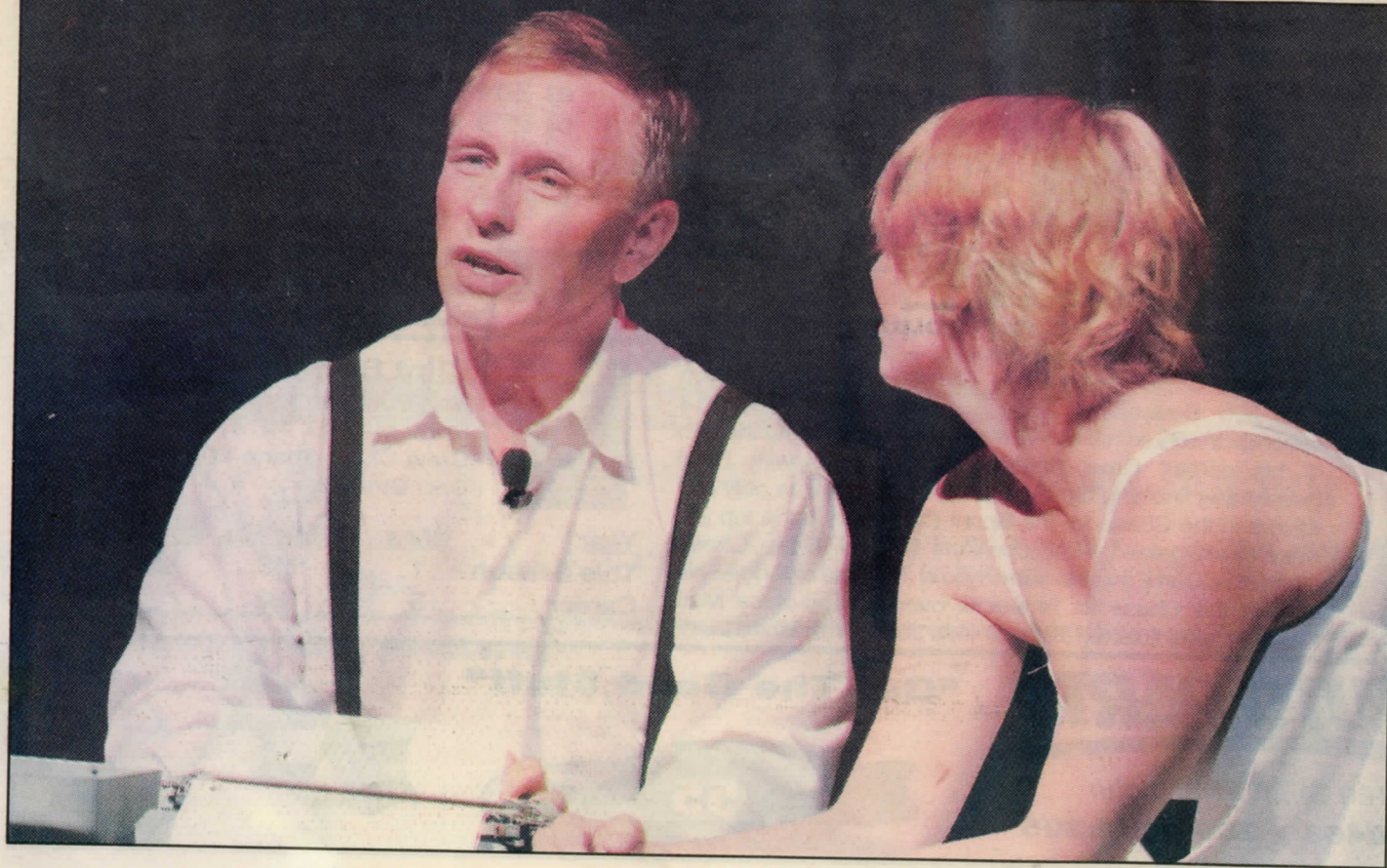
Stage North kicked off it's theatre season with a full-scale musical production of Cabaret.