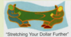
"Stretching Your Dollar Further"