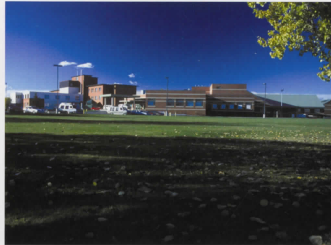
DAWSON CREEK HOSPITAL