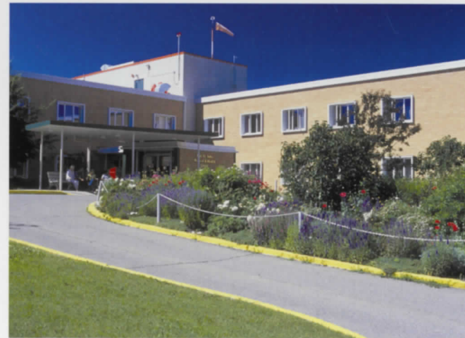
FORT ST. JOHN HOSPITAL