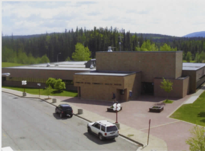
TUMBLER RIDGE HEALTH CENTRE