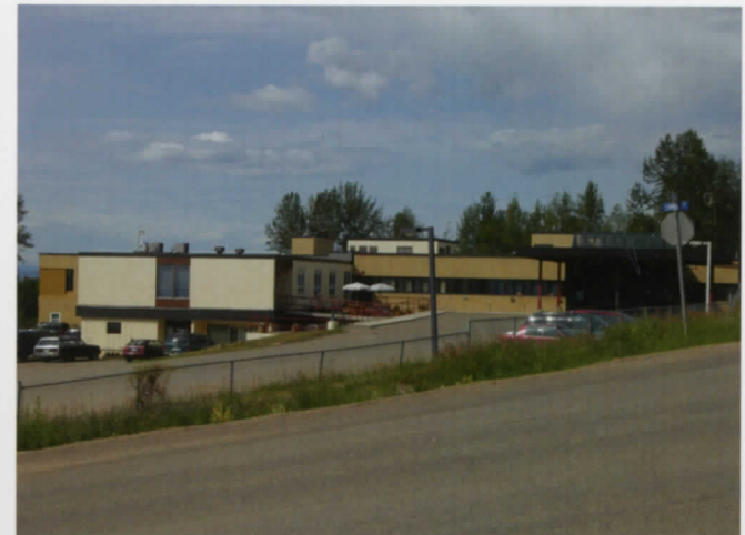
FORT NELSON HOSPITAL