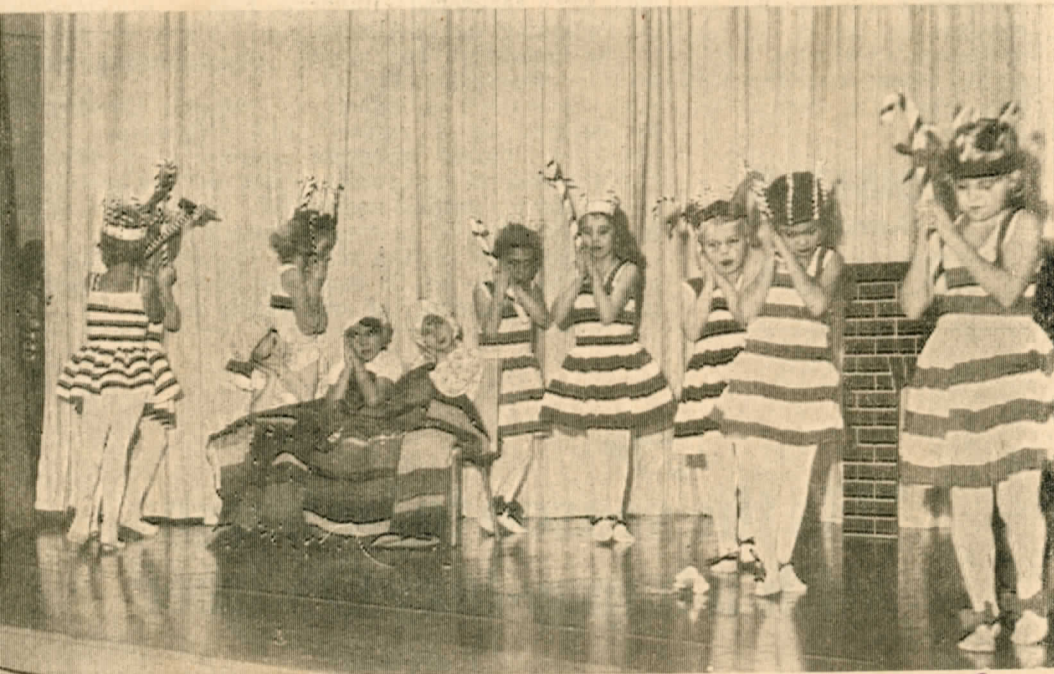
A SCENE at the Central school concert. DEC 30, 1965