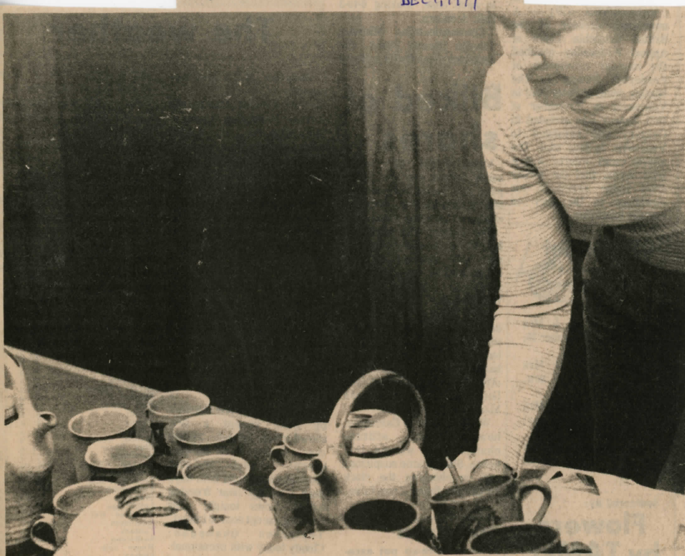
THE FORT ST JOHN Potter's Guild members are very busy preparing for there Christmas Craft Fair. The variety of articles they will have on display and for sale is seemingly endless.

All are welcome and asked to come out and enjoy this event. DEC 1, 1977