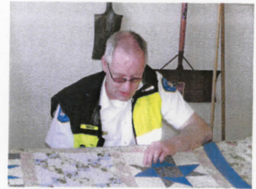
2007 Bluey Day also included the creation of a quilt that was later auctioned for $3200 for equipment to fight breast cancer! Way to go Fort St. John!

On May 31 everyone meets for the day and the fun begins. Not only is Bluey Day a day about cancer it's a day to celebrate our survivors, fighters, and our future.