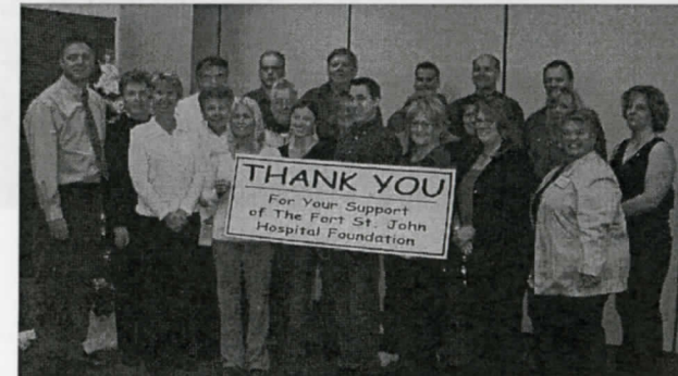
Third Party organizations, such as the Remax Group, fundraise to support the Fort St. John Hospital.

Bluey Day - is conducted by the BC Ambulance employees along with the Fort St. John Hospital Foundation to help raise funds for cancer patients at the hospital. Volunteers raise funds by shaving their heads to purchase equipment to help detect and treat cancer.