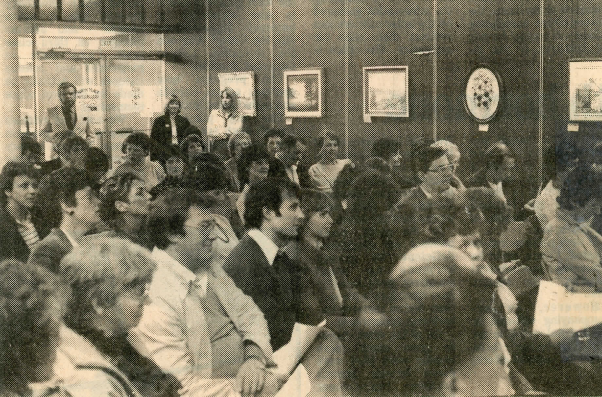
THE CROWD was interested but a little slow in starting the bidding at the first art auction held here last Thursday evening. Perhaps waiting to see what others were going to bid or just taking their time getting warmed up was this gathering of 130 paid guests who showed up at the North Peace Art Gallery on Centre Avenue. All of the works sold were donated by members of the North Peace Art group with proceeds going towards establishing a permanent art gallery in the city.