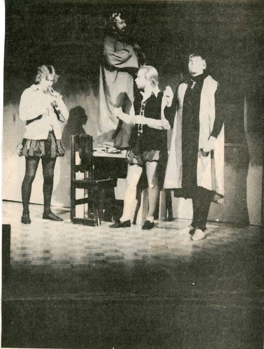
STAGE NORTH put on a number of plays over the season and two are shown in the photographs above and below. The above photograph is from