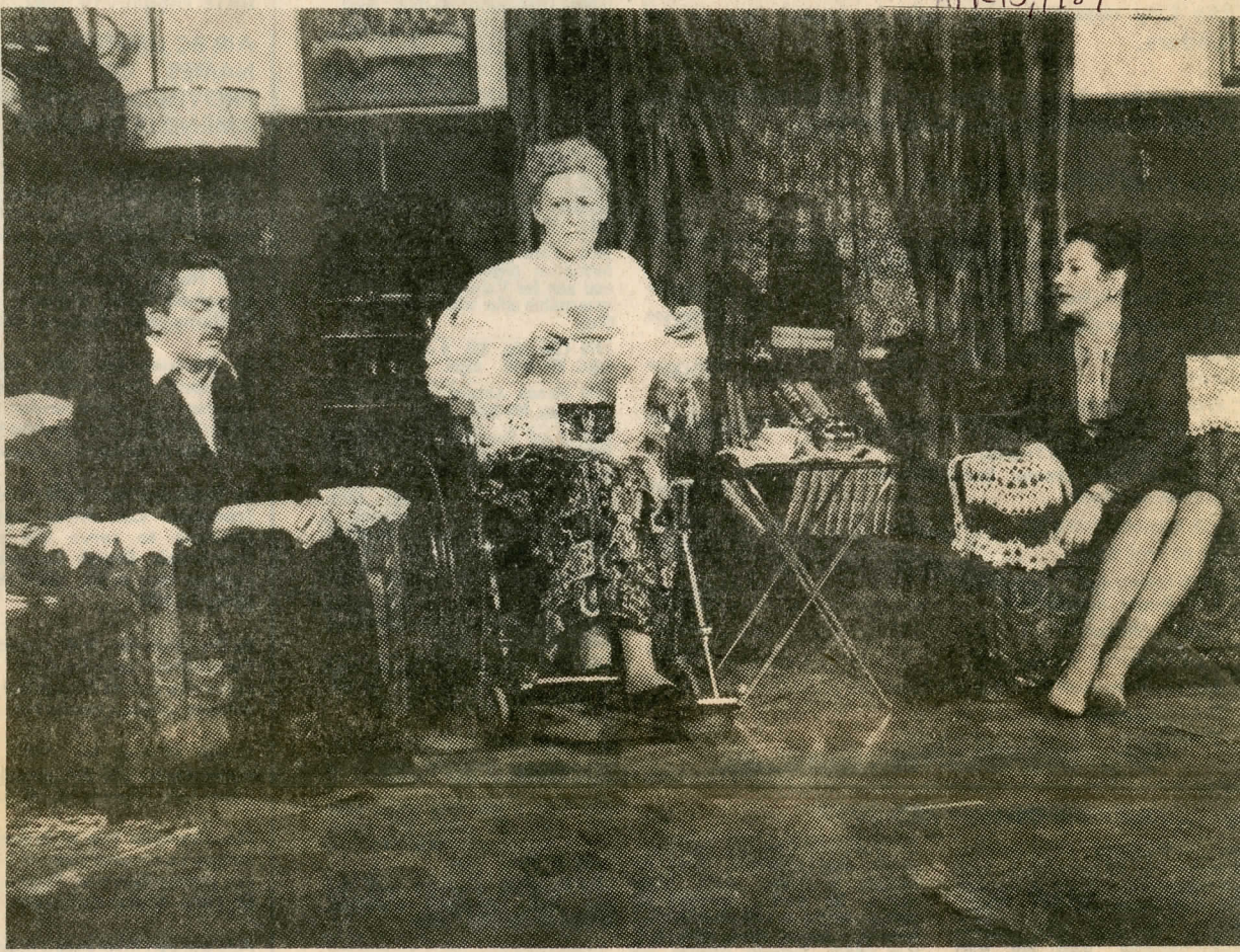
THE FORT ST. JOHN Art's Festival ended in an evening of theatre last weekend as local groups put on a number of plays at Northern Lights