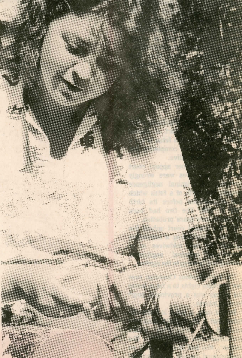
Members of the weavers' guild indulged in a scarf-making contest, starting almost from scratch.