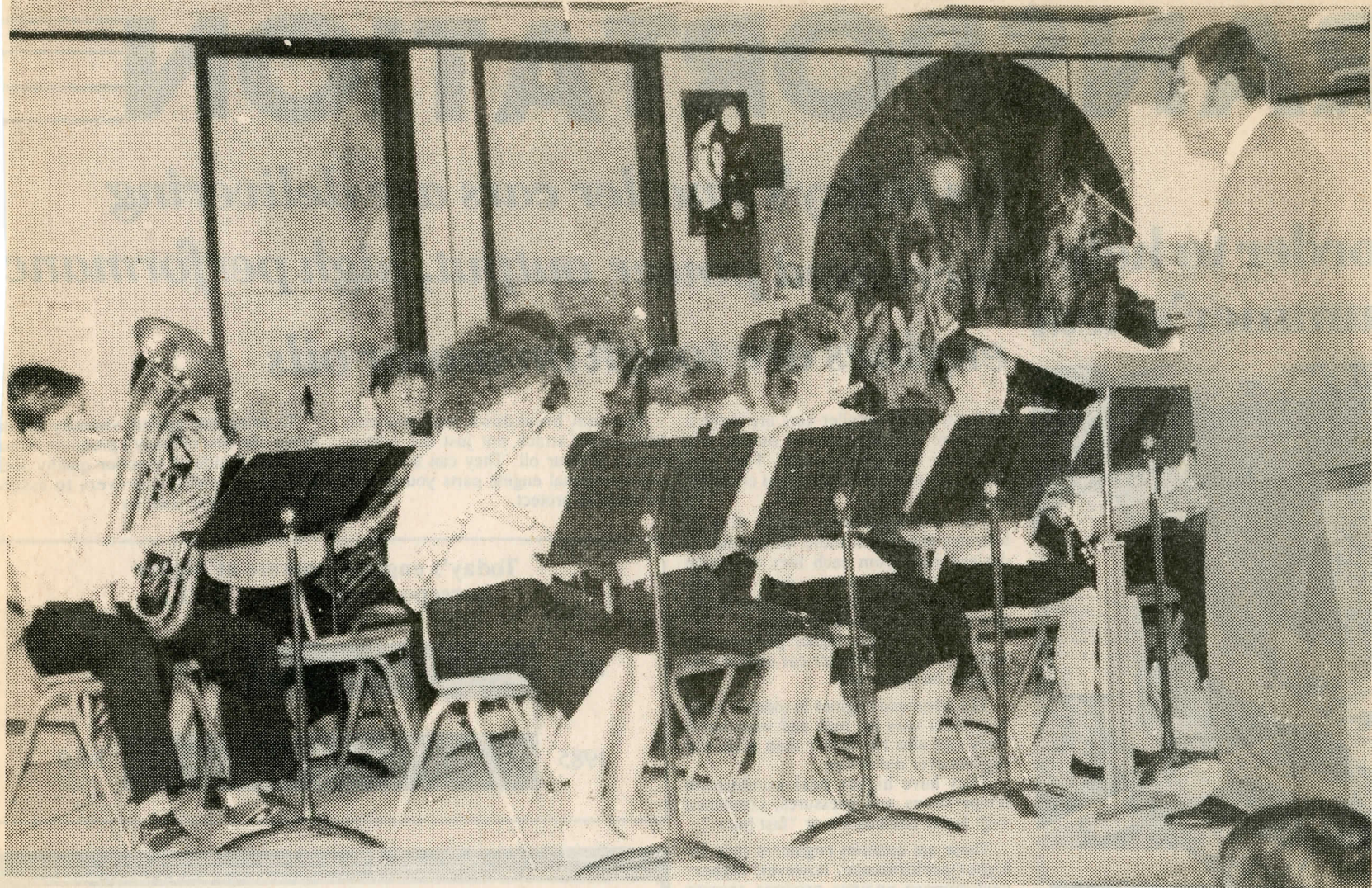
SPRING CONCERT at Dr. Kearney school started off with a bang and a mounting crescendo as the Beginning Band began the second half of a pleasant evening of music by the school's beginning, senior and