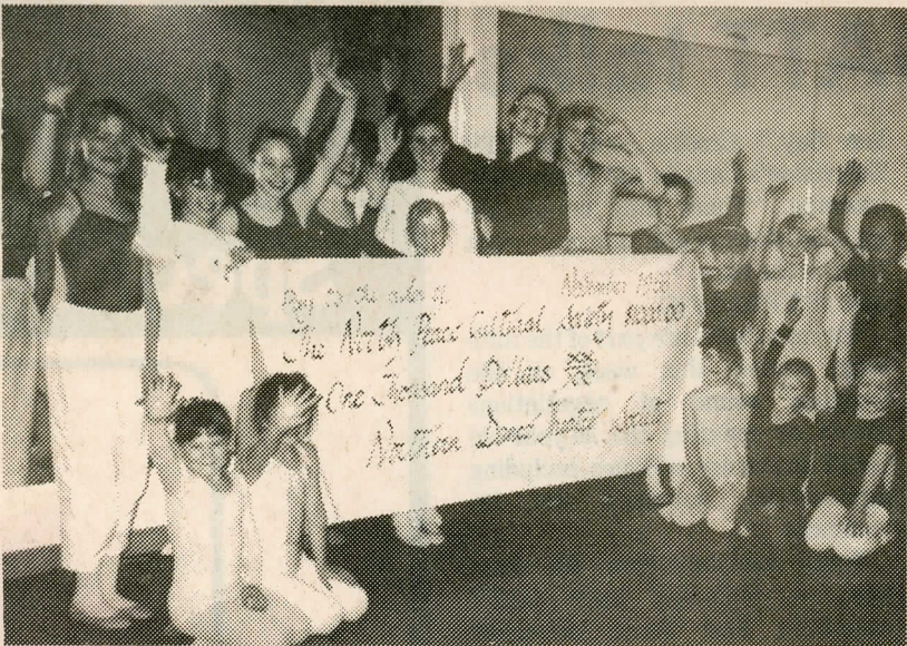
The happy dancers of Northern Dance Theatre Society were pleased to present $1,000 towards the construction of the new Arts Centre. They are looking forward to performing on the new stage in a proper theatre. In the meantime, most of their recitals and performances are held in the North Peace Secondary School.