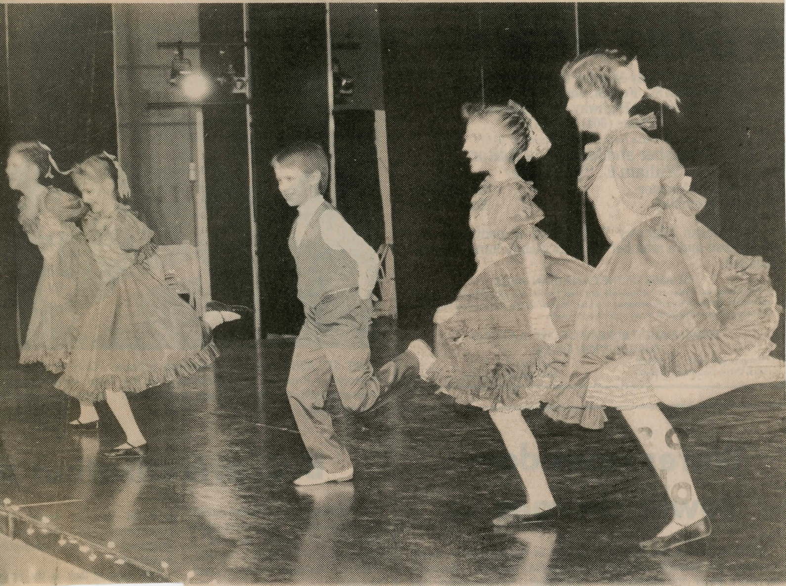
NORTHERN DANCE THEATRE dance extravaganza proved a popular attraction last weekend, with dancers of various ages and performing levels in show at the Before Stage.