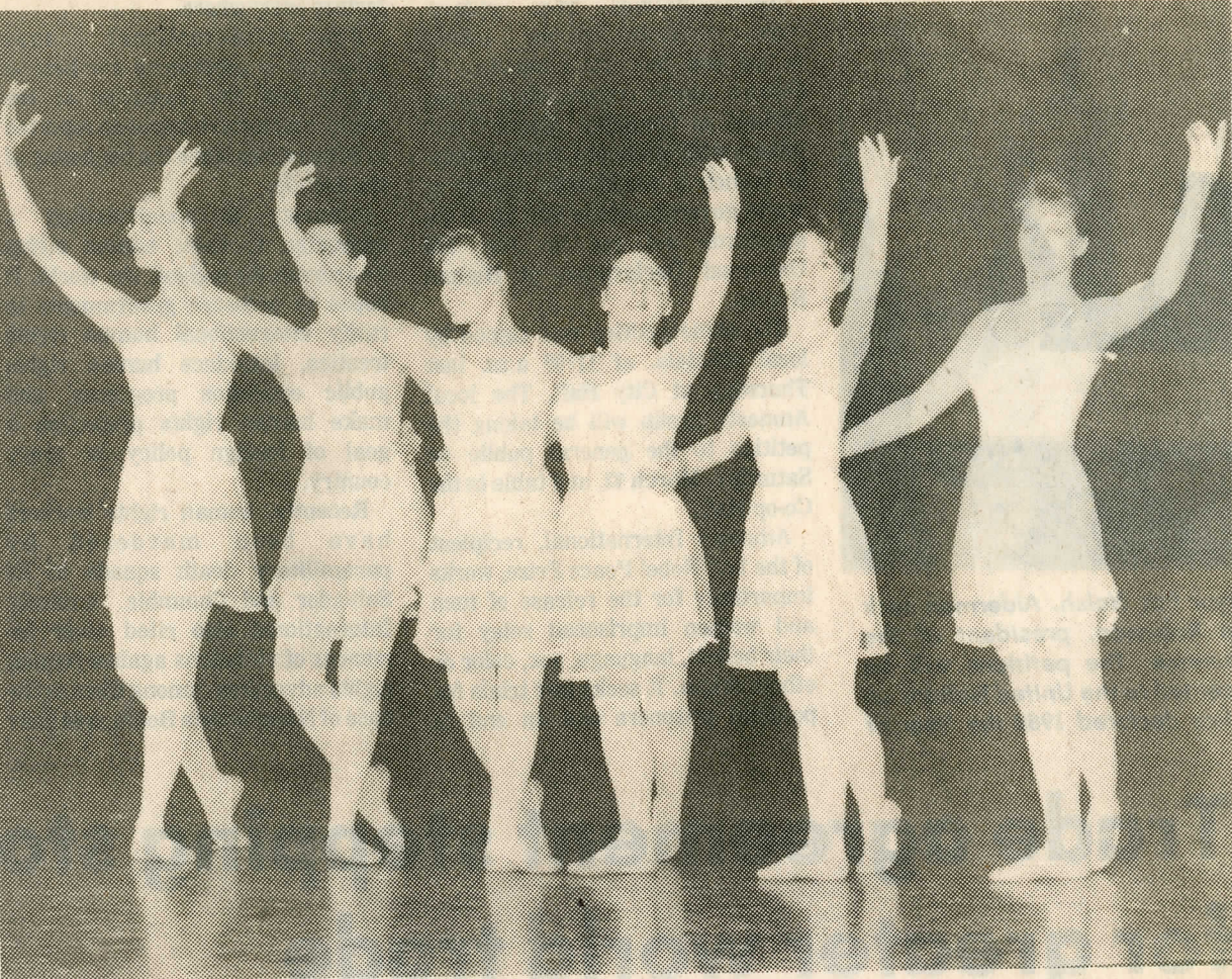
NORTHERN DANCE Theatre presented a dance extravaganza Friday, Saturday and Sunday at the