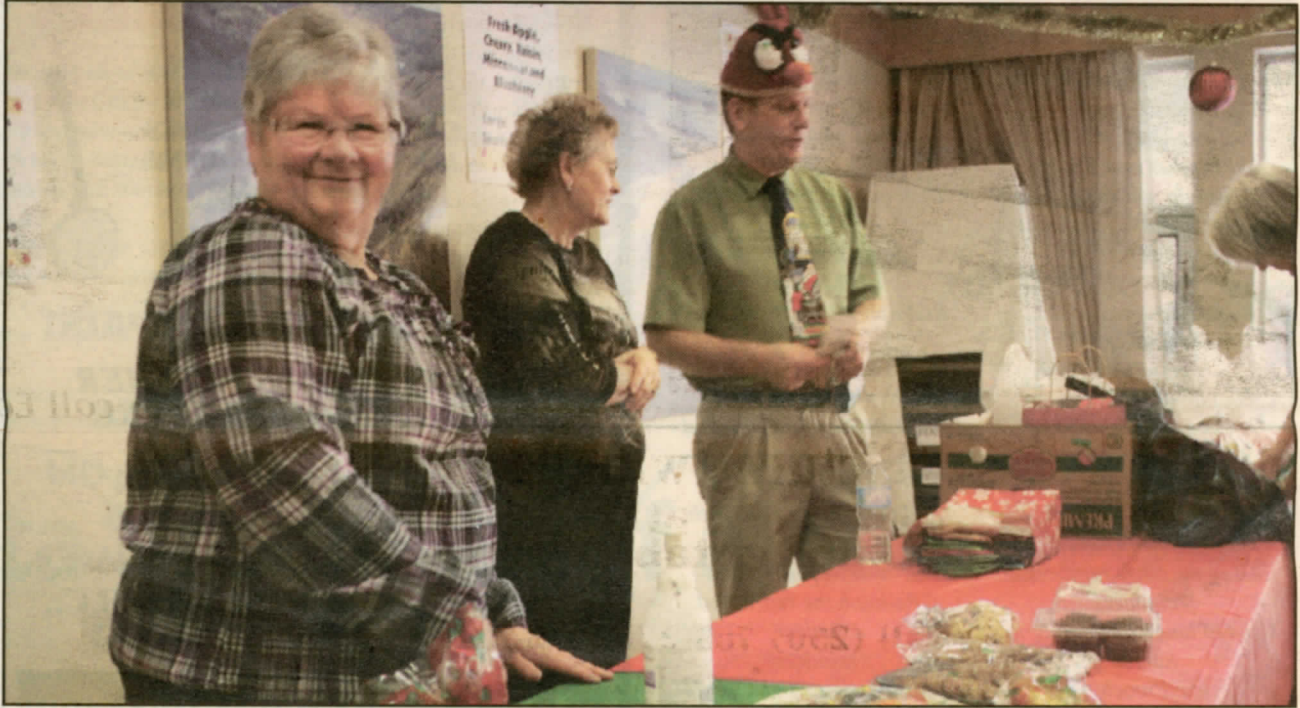
Rotary Manor in Dawson Creek hosted a Bazaar and Tea last Saturday complete with crafts, raffles, baked goods and of course, tea. All proceeds went towards resident programs and activities.