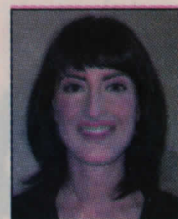
STATE OF THE ARTS