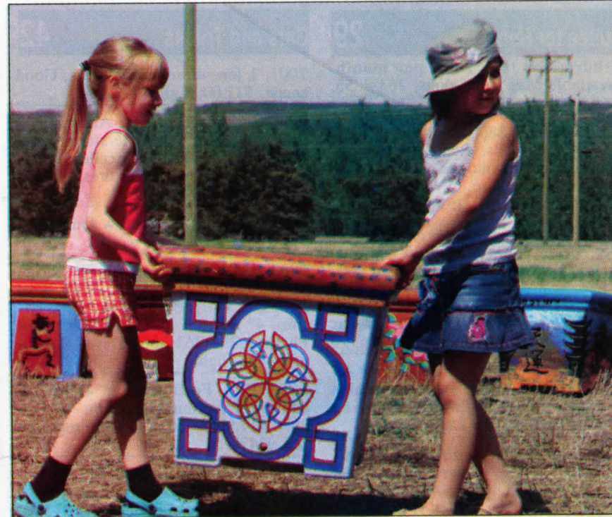
The Flower Pot Project helps to beautify the streets of Fort St. John, while showcasing the artwork of local painters. After two years of being on the street the flower pots are auctioned off to raise funds for the arts council and a member group.

The society also brings in art instructors for adult workshops in acrylic and watercolour painting.