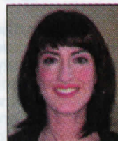
STATE OF THE ARTS