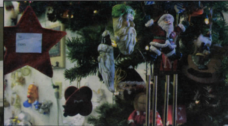
Kyla Corpuz photos Christmas decor for sale by donation at the ArtsPost. It runs until Dec. 1.