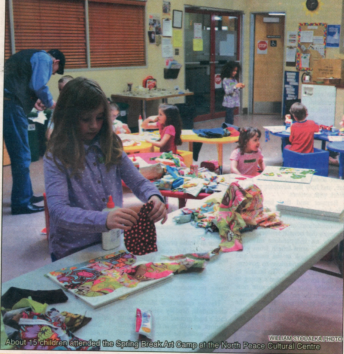
About 15 children attended the Spring Break Art Camp at the North Peace Cultural Centre