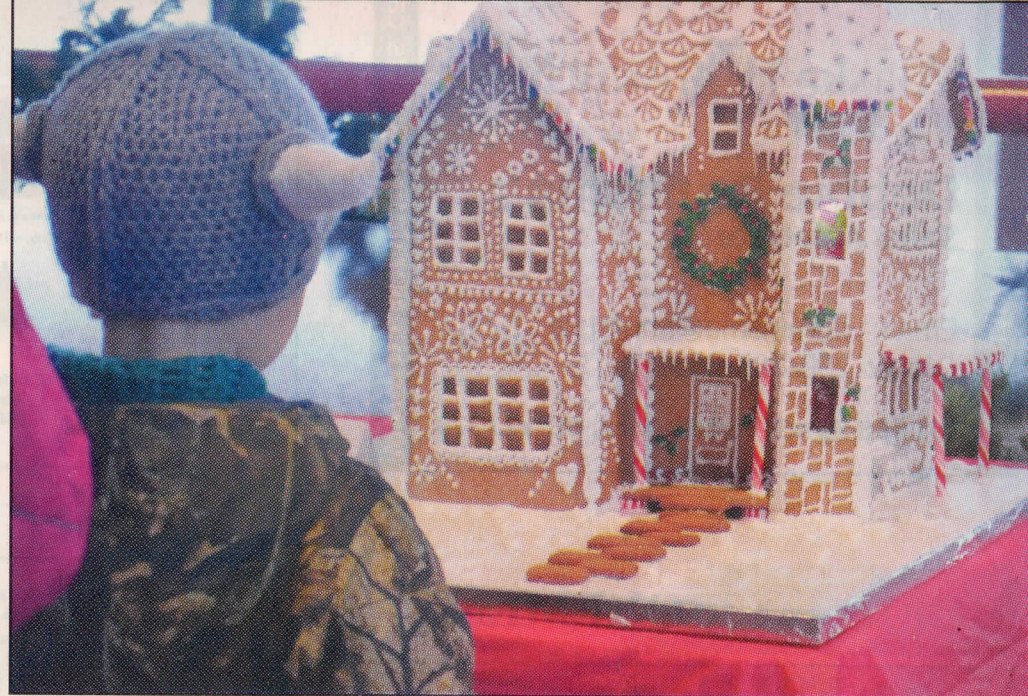
Admiring "The Victorian," which won the Grande Prize.