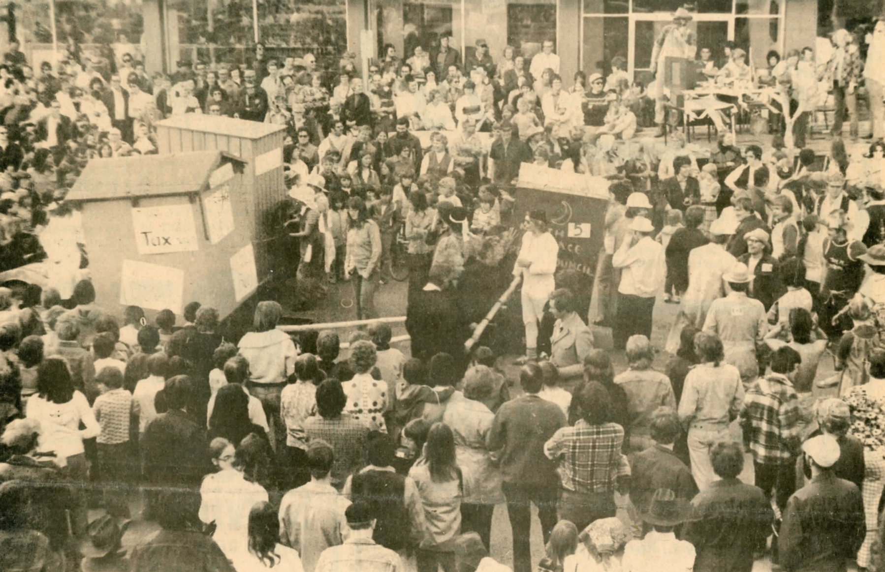
CROWDS GATHERED to see just what kind of "gas" these outhouses ran on during the Calcutta for the Outhouse Race.