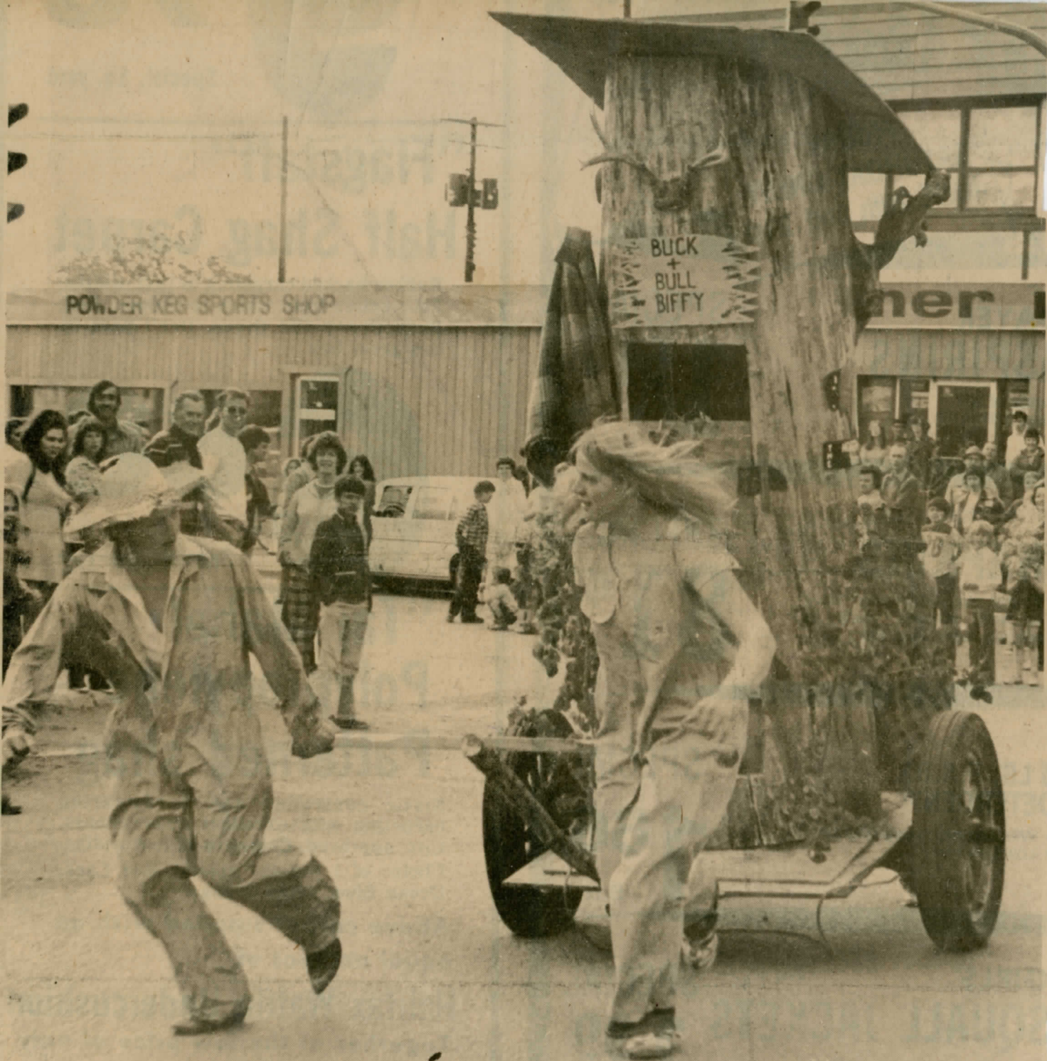
BEST ARCHITECTURAL DESIGN in the Outhouse Race went to this entry from the Taylor Zoo seen here rounding the corner by the Central Department Store.