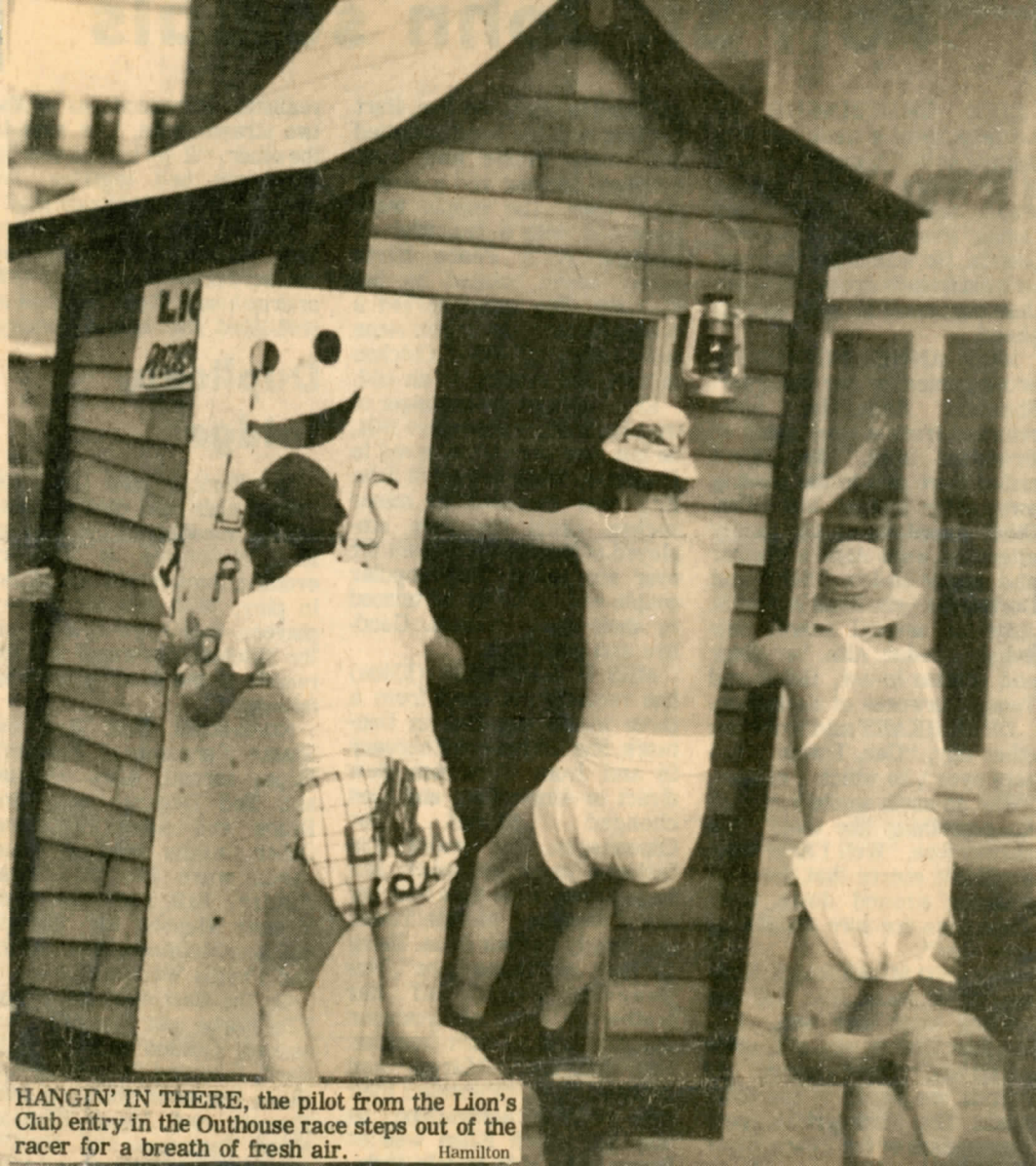
HANGIN' IN THERE , the pilot from the Lion's Club entry in the Outhouse race steps out of the racer for a breath of fresh air.