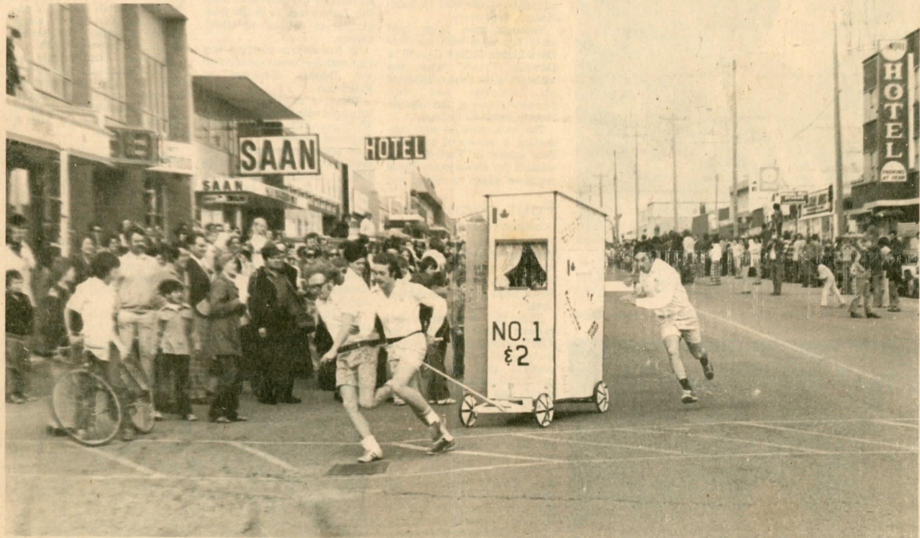
EVENTUAL WINNERS in the First Annual World's Class A International Outhouse Race — the team from Canada Manpower — show their fine form and smooth execution of all the movements as they round the corner at the Lido Theatre and head for the uphill grind. The race held on Friday evening to open Totem Days drew