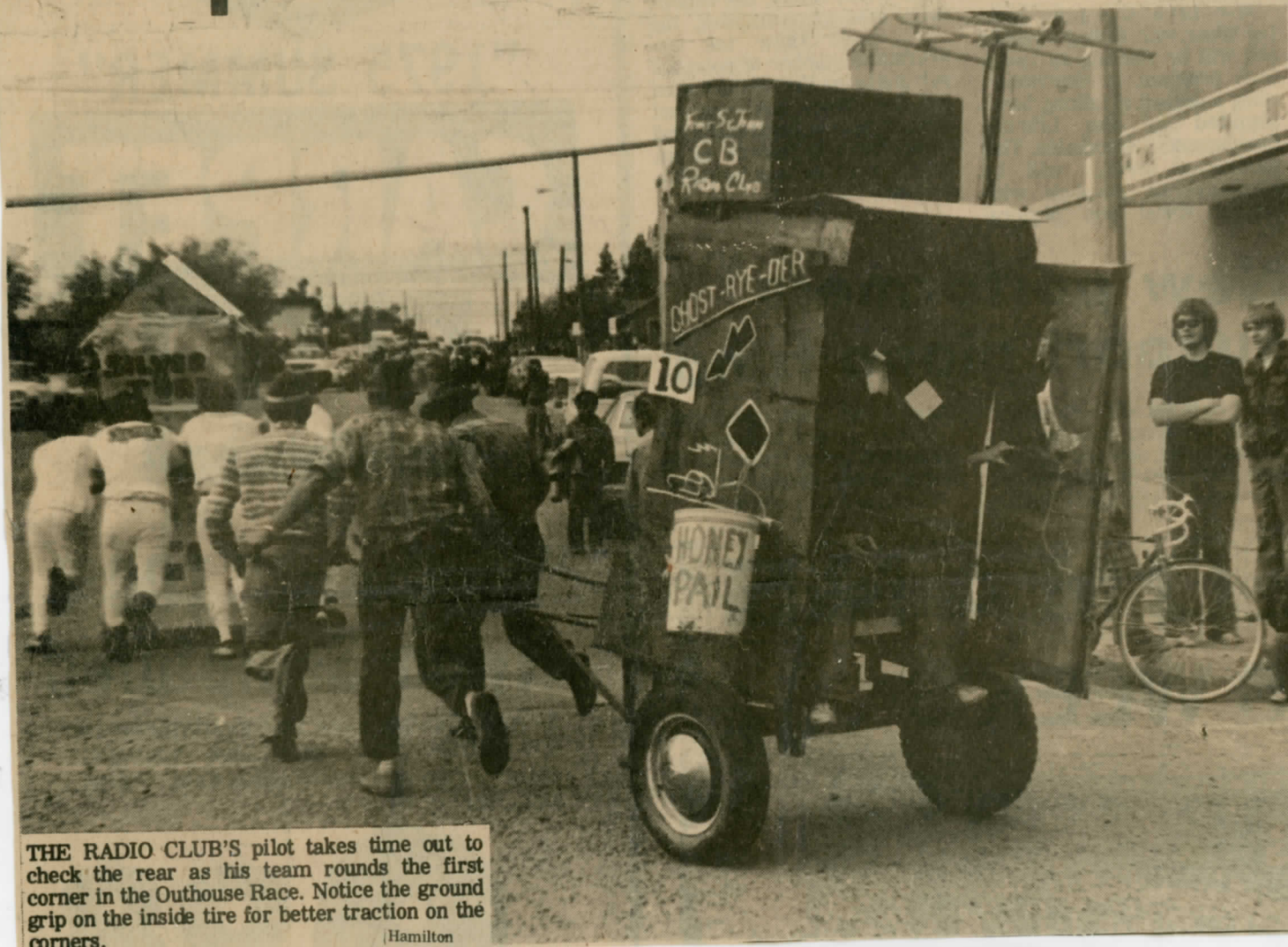
THE RADIO CLUB'S pilot takes time out to check the rear as his team rounds the first corner in the Outhouse Race. Notice the ground grip on the inside tire for better traction on the corners.