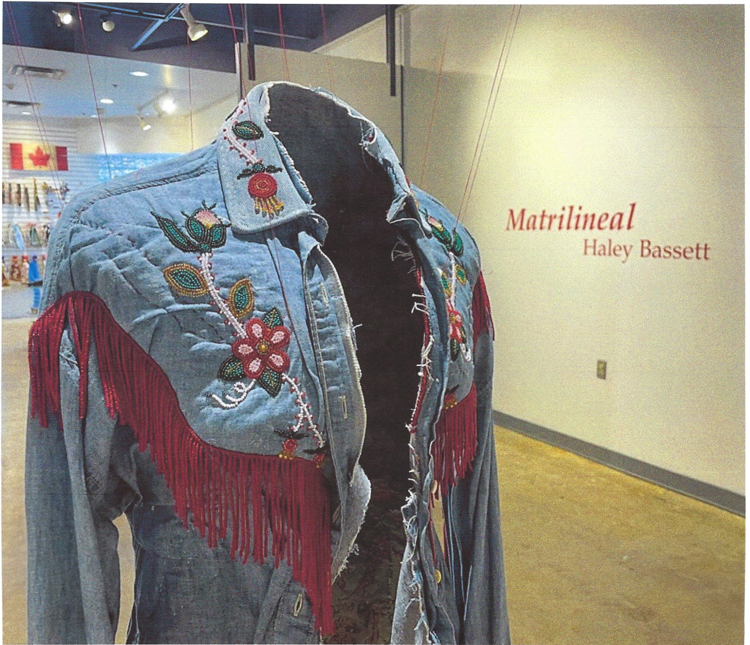
'Second Skin', seed beads, thread, sculpting mesh, beading foundation, denim, copper and steel wire and Levi's shirt, by Haley Bassett.

Métis beadwork, Eastern European matryoshka dolls, and wild roses stitch together to form an intricate and delicate new exhibit opening Friday at Peace Gallery North.