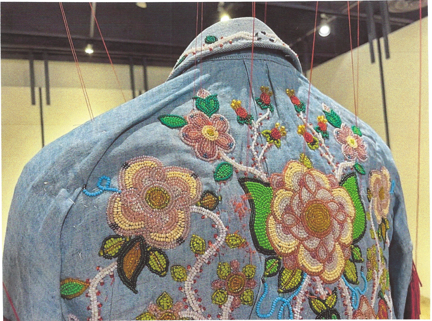
Beadwork detail of 'Second Skin' by Haley Bassett. By Matt Preprost

On the walls, the exhibit may appear sparse, but all the stunning is in the details. The clear focal point of the exhibit is Second Skin , a mixed media work of seed beads, thread, sculpting mesh, beading foundation, denim, copper and steel wire, and a Levi's shirt.